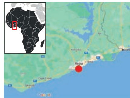
Accra is the capital of Ghana, located on the shores of the Atlantic Ocean in Western Africa

The Odaw River is strategically very important for Accra since it drains a large portion of the city and finally flows into the Atlantic Ocean through the Korle Lagoon. However, the excessive amount of waste and silt restricts its water flow and prevents it from fulfilling its purpose. The Odaw River has become one of the most polluted waters on earth. As a result, Accra has frequently endured dangerous flooding