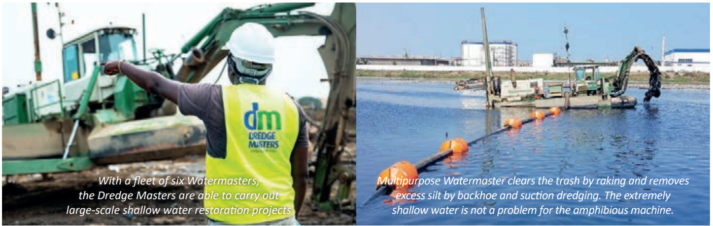
With a fleet of six Watermasters, the Dredge Masters are able to carry out large-scale shallow water restoration projects