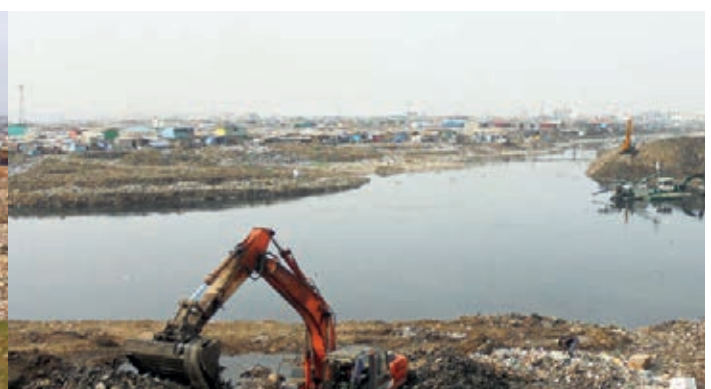
Cleaner and healthier environment, improved water flow, lower risk of floods