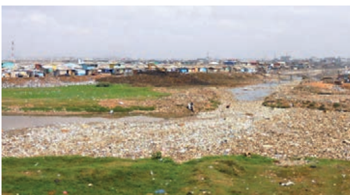
Pollution, excessive siltation, poor water flow, high risk for floods